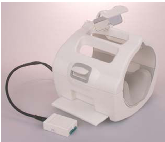
Figure 1 GE Medical Systems 1.5 Split Head Coil Mount.

Two dimensional MRI scans, 23 centimeters high and 23 centimeters wide were obtained. Each 2D MRI image contains an array of 256 pixels wide by 256 pixels high. Thus, the image resolution in this case is 0.0898 cm/pixel (23 cm divided by 256 pixels and converted to mm is 0.898 mm/pixel). The images were saved in DICOM format and