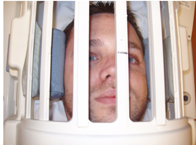
Figure 2 Head mount with human subject in place.

then converted in TIFFs for importation into ImageJ software (ImageJ 1.33 u National Institutes of Health, USA) for evaluation. The images were thresholded to interactively set lower and upper threshold values between 40 and 255. Figure 3 is representative of the image produced by this step of ImageJ analysis. Then the threshold image