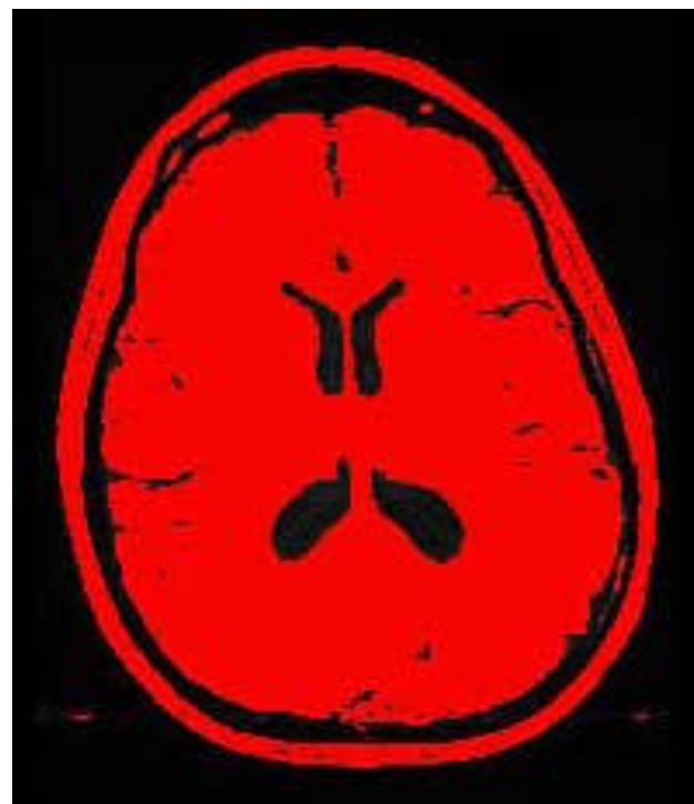
Figure 3 Threshold image.

then converted in TIFFs for importation into ImageJ software (ImageJ 1.33 u National Institutes of Health, USA) for evaluation. The images were thresholded to interactively set lower and upper threshold values between 40 and 255. Figure 3 is representative of the image produced by this step of ImageJ analysis. Then the threshold image